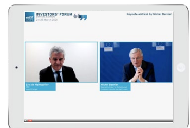
Investors' Forum 2021 featuring Michel Barnier, Special Advisor to the European Commission President, Ursula von der Leyen